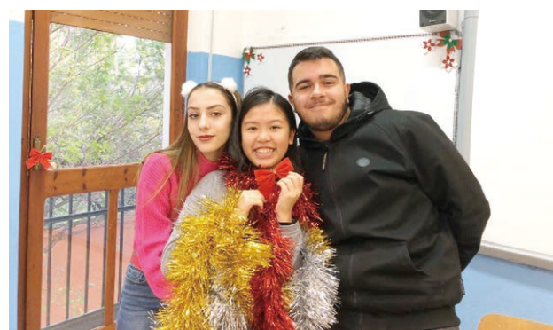
My friends at school

I was not living in a famous city but a small town called San Gavino Monreale on an island, Sardegna. There aren't any skyscrapers, which is quite distinct from Hong Kong. All I found in San Gavino Monreale was nature. When you go to another village, you can see many trees, grass and wildlife like horses, sheep and so on. At night, there were no streetlights. Although it was very inconvenient, I could see many stars in the sky and enjoy the tranquility here.