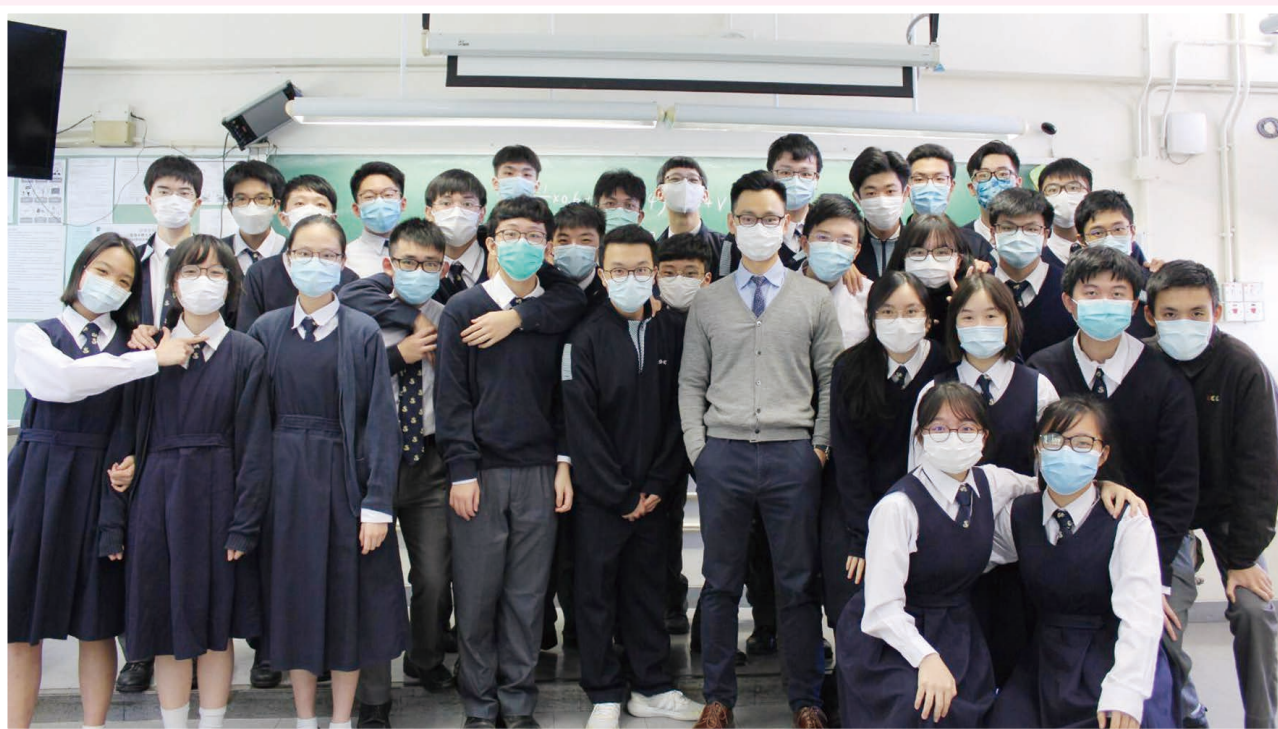
We bid a fond farewell to our beloved English teacher on the last day.

"Tough times never last, but tough people do." - Robert H. Schuller