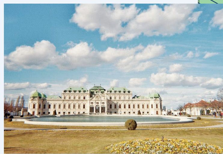
Schloss Belvedere, Vienna