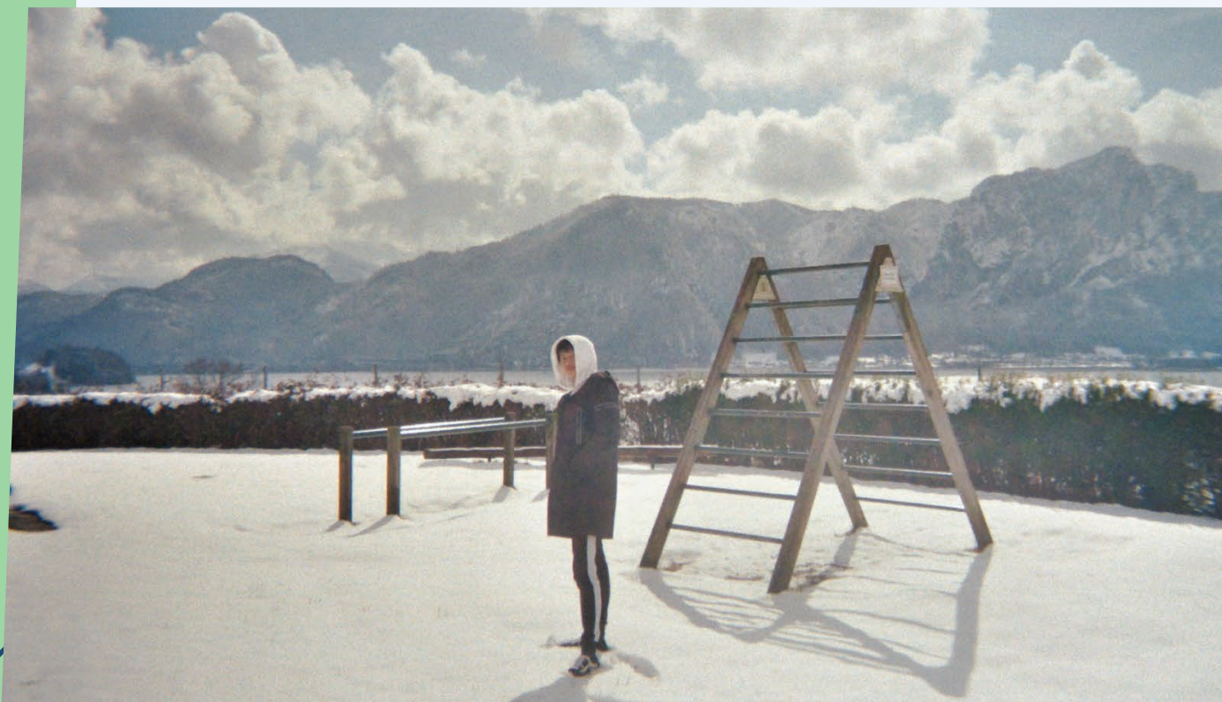
Me in Mondsee