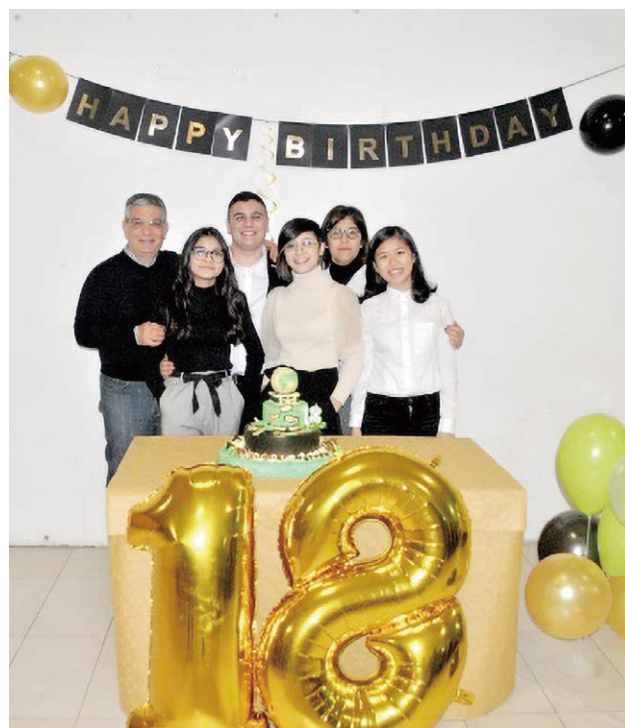
The birthday party of my host brother

always go out to play with friends in the town at night. They go to bars and chat with each other. During festivals, everyone had parties with families. We had dinner, danced and sang till 3:00 in the morning. My host family has definitely showered me with love and care for the whole year!