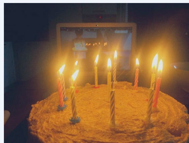
My friends and I celebrate my 16th birthday at home because restaurants are closed.

Perhaps 'life-changing' is an adjective every returned exchange student would use to describe their journeys. To me, 'life-changing' means 'having an effect that is strong enough to change someone's life.' While we would surely have our own definition of 'life-changing' as our lives are unique, we all have the same goal - to make a better me. I am quite sure that in the future when I look back, this journey would be freaking worthy.