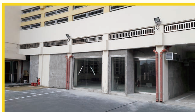
First Phase of Setting up of STEM Education Room on Ground Floor

As support to the curriculum development of the school, we are glad to announce that hardware improvement would also be carried out. Responding further to the proposal of strengthening STEM education stated in the report published by the Task Force on Review of School Curriculum in Sept 2020, we finally launched the construction of the STEM Education Room on the ground floor of the school premises after overcoming various obstacles earlier this year. It is hoped that the renovation work of the room can be completed by the second term of the coming school year and an ideal venue can then be available for lessons and the holding of STEM activities. Furthermore, after being used for years, the Cookery Room will be remodelled with an improved layout as well as installation of new furniture and appliances, which will enhance functionality and safety. The space can also be used more effectively to promote relevant extra-curricular activities.