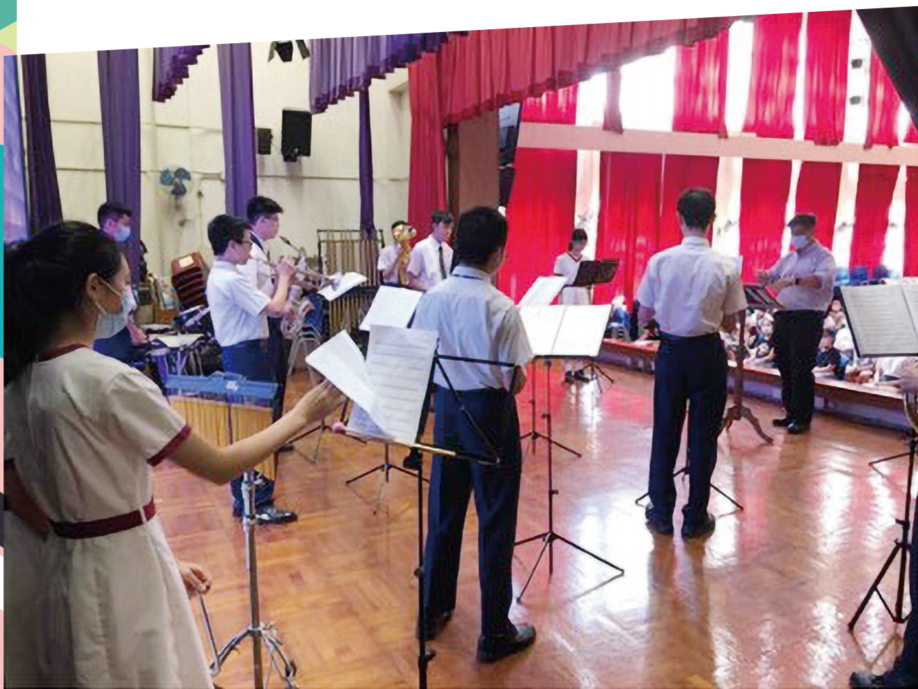
Performance on S1 information day with special hygienic arrangements under COVID-19

practical advice from the band members of Japanese secondary schools, their conductors and teachers. The experience of exchange has strengthened my determination to pass on the love and spirit of unity to the juniors. I truly hope that the soul of School Band can be handed down from age to age endlessly.