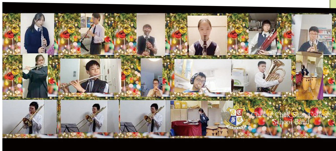
The wonderful masterpiece, Christmas Swing!

roses, we made every effort to push all members to their optimal state for the shows. Yes, those practices might be tiring, but I never feel it. Whenever I failed to play the pieces, the senior guided me; whenever I was tired of practising, teammates sitting around encouraged me; if I lagged behind the progress, others would not keep on advancing but stop and upskill me. Long taken care of by my teammates, I had gained valuable experience of teamwork and returned their gift of care to the juniors as a leader by teaching the juniors everything I got. With the virtuous cycle keeps rolling over, generations of skilled school members have left the band, while fresh blood is adding in. Back then when I was a freshman and following School Band to visit Japan, I was already well prepared as the seniors had given succor and strength to me. I benefited a great deal from the exchange. Apart from attending a treasurable masterclass on trombone, I received