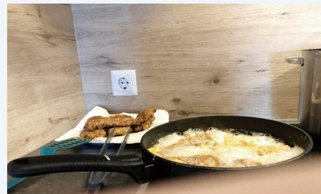
A typical Austrian dish - Schnitzel, cooked by myself during my quarantine after contacting a friend who was tested positive.