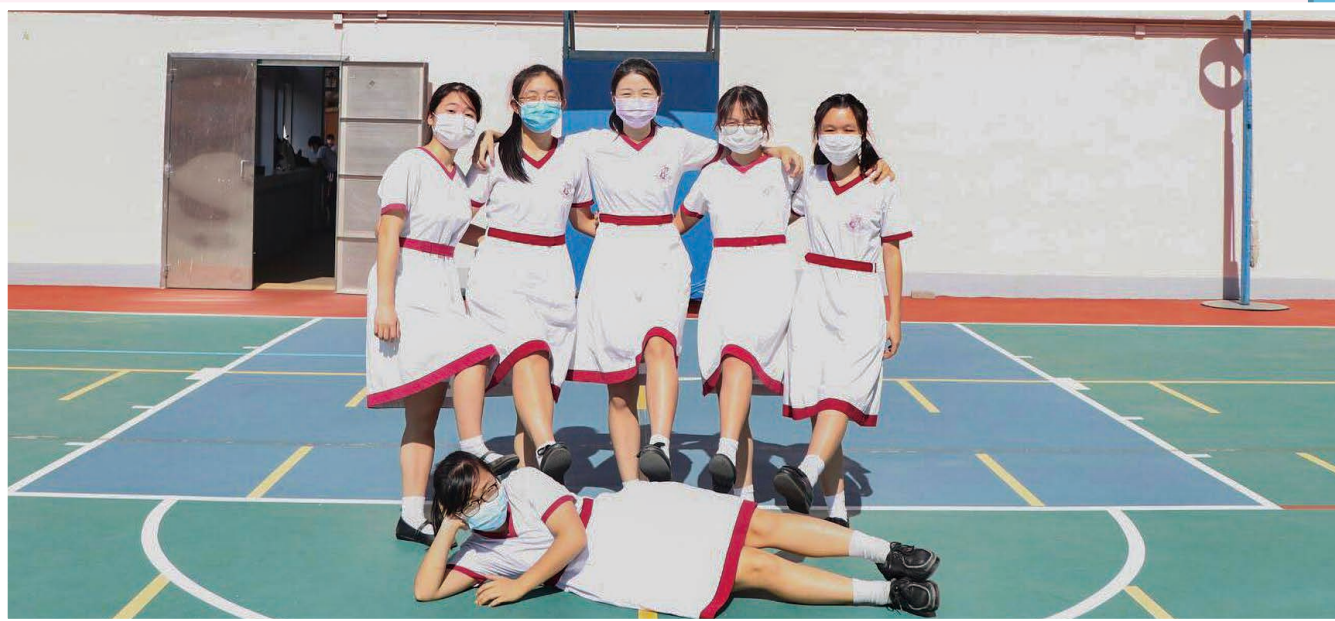
Games on the basketball court have strengthened our bond of friendship.

On top of this, class suspension allowed me much time for my own exploration of multitudinous learning resources online. I was used to learning things in a conventional way, whereby I mostly took reference from books and notes given by teachers. Thanks to the availability of tutorial videos and articles on the Internet, I managed to assimilate different in-syllabus knowledge and attain practical skills like culinary techniques into the bargain. For instance, I watched videos on Edx about epidemiology and read articles to enrich my vocabulary, as well as to broaden my horizons.