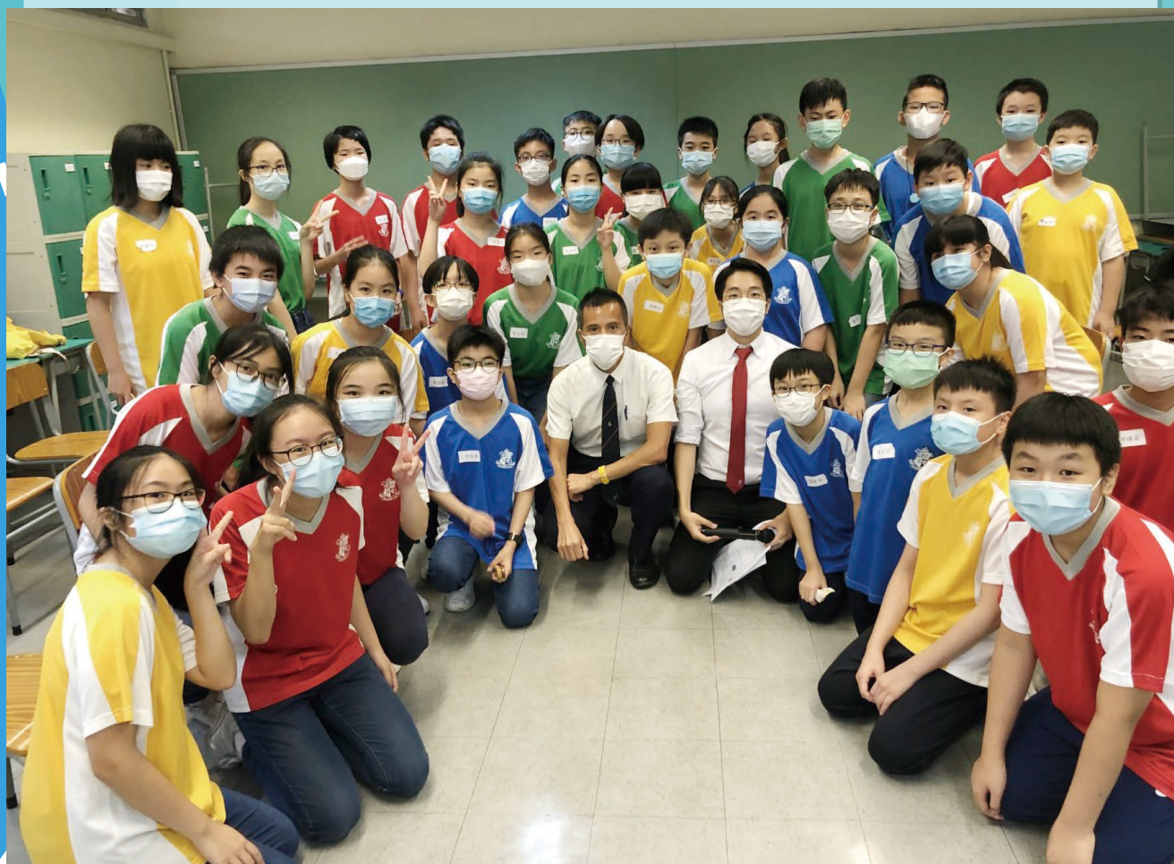
Meeting our lovable freshmen at the orientation activity brings us a whale of joy and satisfaction.