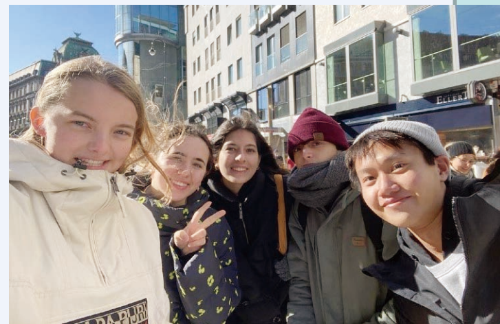
My friends and I (far right) hang out in Wien after the government announced everything started to open.