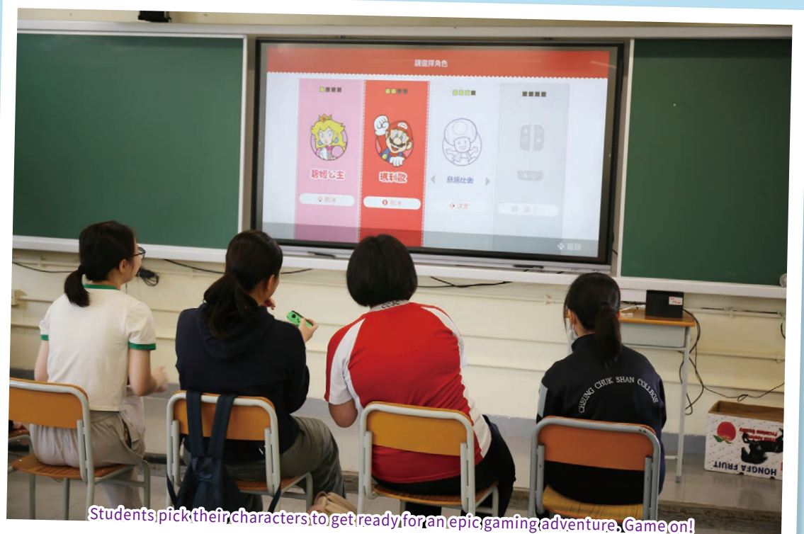
Students pick their characters to get ready for an epic gaming adventure. Game on!