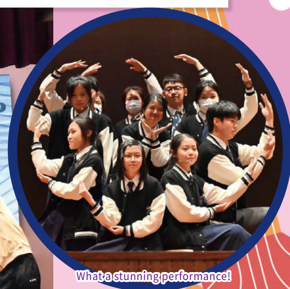
What a stunning performance!