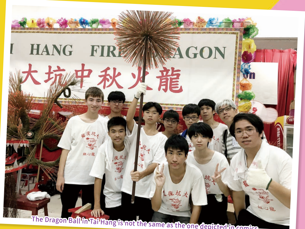
The Dragon Ball in Tai Hang is not the same as the one depicted in comics.