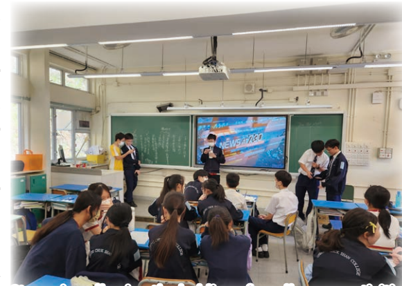
Streaming allowing the holding of small-group activities during English lessons.