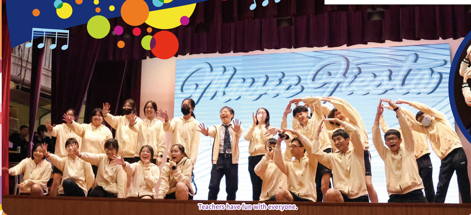
Teachers have fun with everyone.