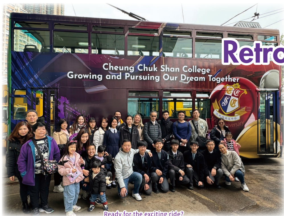
Ready for the exciting ride?