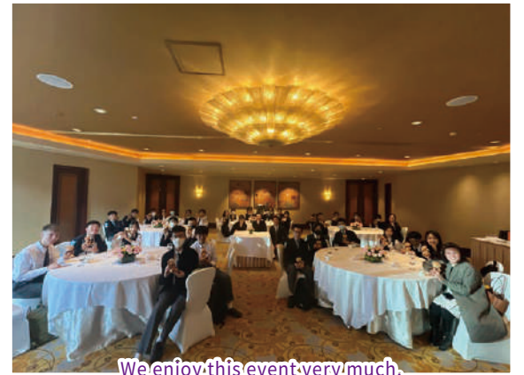
We enjoy this event very much.

Not only did we taste gourmet food using the appropriate etiquette, but we also explored the real gems of Conrad Hong Kong. On top of this, we learned interview skills that can play a crucial role in our JUPAS interviews. Therefore, the Three-Course Meals at Conrad Hong Kong were truly rewarding. (And of course, I mean both meals!)