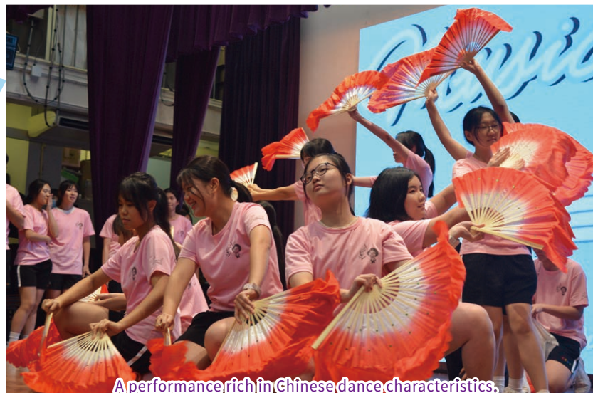
A performance rich in Chinese dance characteristics.