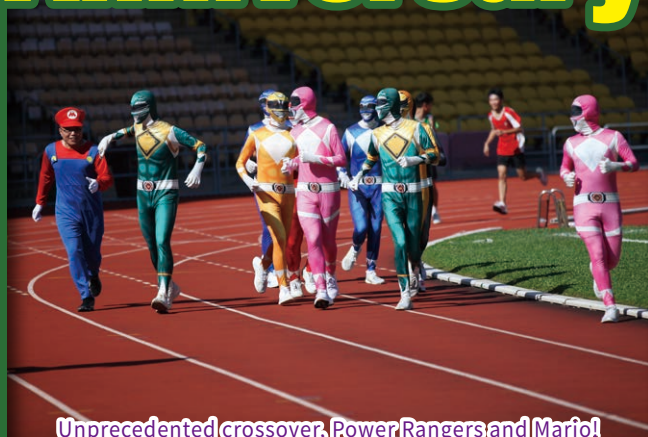
Unprecedented crossover, Power Rangers and Mario!