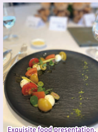
Exquisite food presentation.

I am grateful to my school for organizing such an enriching event, and I am confident that the knowledge and skills gained from this workshop will benefit me in both personal and professional settings as learning and practicing table manners are essential for making a positive impression, enhancing communication, and developing self-confidence and cultural awareness. It enables us to demonstrate respect, create a comfortable dining environment for conversations, and navigate formal occasions with ease. Overall, the workshop served as a reminder of the importance of good manners and the impact they can have on our interactions with others.