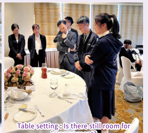
Table setting: Is there still room for improvement?