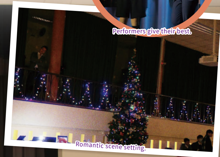
Romantic scene setting.