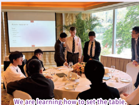
We are learning how to set the table.

As an S5 student, I recently had the opportunity to take part in a Dining Workshop organized by our school. The workshop took place in a luxurious five-star hotel, Conrad HK. It is aimed at providing us with basic dining etiquette skills via an excellent three-course dining experience during the post-exam period. Additionally, the hotel also offered us a chance to visit their premises and attend a JUPAS talk.