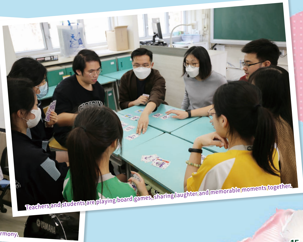
Teachers and students are playing board games, sharing laughter and memorable moments together.