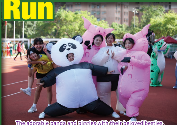
The adorable panda and piggies with their beloved besties.