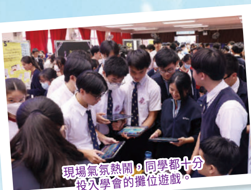
現場氣氛熱鬧，同學都十分投入學會的攤位遊戲。