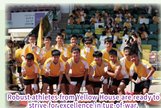
Robust athletes from Yellow House are ready to strive for excellence in tug-of-war.

As I reflect on Sports Day, I can't help but feel a twinge of sadness. This year marked my final active participation in the house events as I am entering S6 soon. Knowing that I won't be able to compete as a core member of the Yellow House in future Sports Days fills me with mixed emotions. However, I am determined to cherish every moment and leave no room for regrets. The passion and camaraderie that define CCSC's Sports Day are unlike anything I have experienced elsewhere. I am grateful for the memories, friendships, and life lessons that have been bestowed upon me by Yellow House.