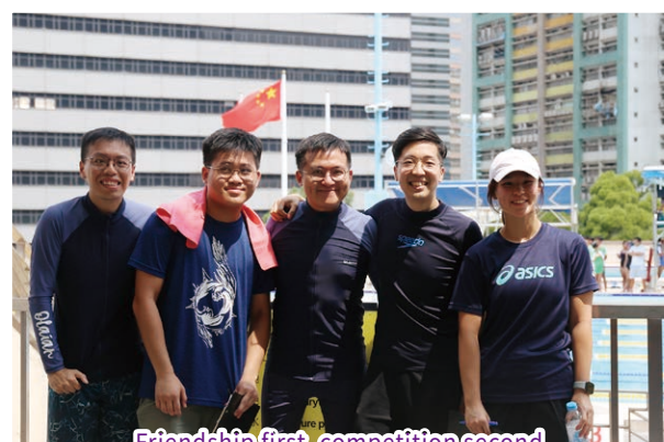
Friendship first, competition second.