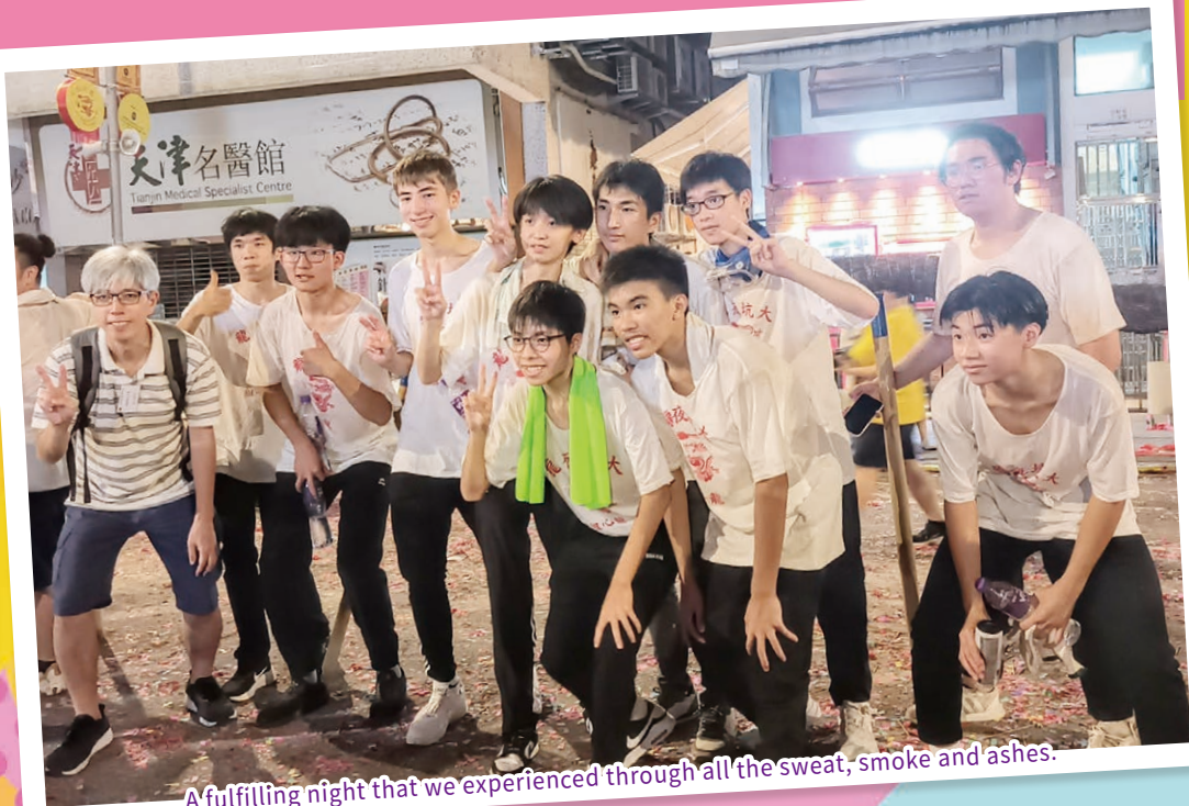
A fulfilling night that we experienced through all the sweat, smoke and ashes.

Also, I would like to thank my schoolmates. Without them, I would not have had such a great experience!