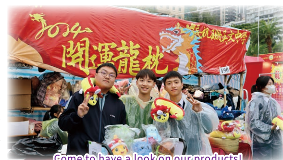
Come to have a look on our products!

As the 2023/24 school year is approaching its end, I hope all students and teachers alike can have a good rest, not just as a small reward for the hard work done, but also to prepare ourselves for another hectic school year and challenges ahead.