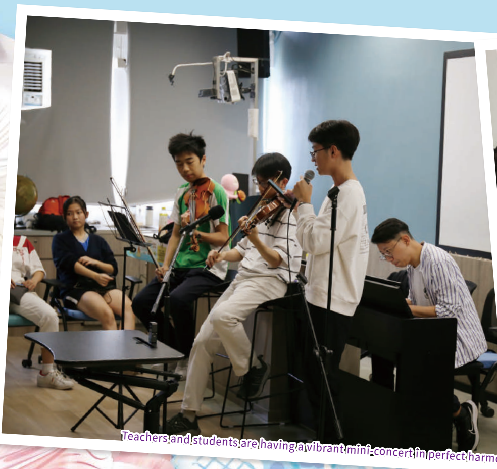
Teachers and students are having a vibrant mini-concert in perfect harmony.