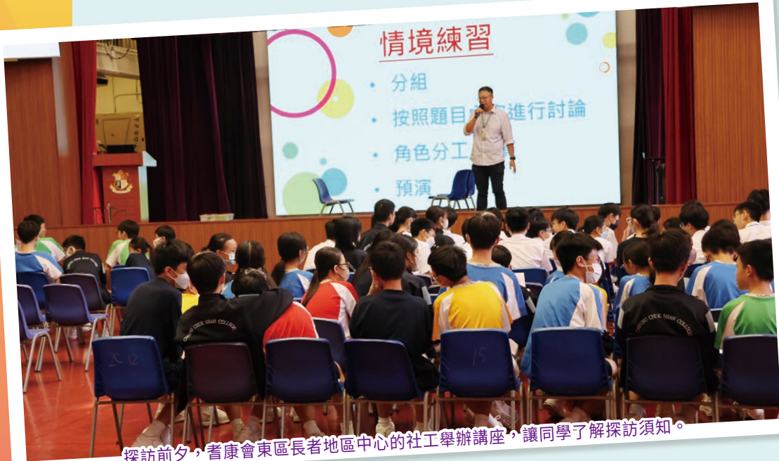
探訪前夕，耆康會東區長者地區中心的社工舉辦講座，讓同學了解探訪須知。

幸福不僅是擁有豐富的物質，我十分珍惜我的爺爺、奶奶。上學前他們總會對我說：「小心點呀！」放學回家後又會聽到他們說：「你回來啦！」看似微不足道，其實這是最單純的幸福，我也會多陪伴他們，讓他們安享晚年。