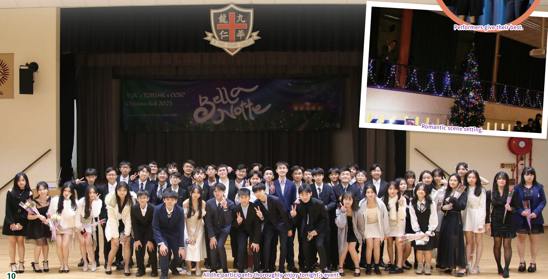
All the participants thoroughly enjoy tonight's event.