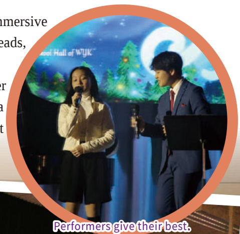
Performers give their best.

The Joint School Christmas Ball has become a highly anticipated event in our school community, and this year was no exception. The number of attendees exceeded previous records, reflecting the growing enthusiasm and excitement surrounding the annual celebration. The ballroom was a sea of colorful attire and joyful faces as students from various grades and backgrounds came together to enjoy the festive spirit. The enchantment of Bella Notte will linger in the hearts of all who attended, carrying the memories of this magical night for years to come.