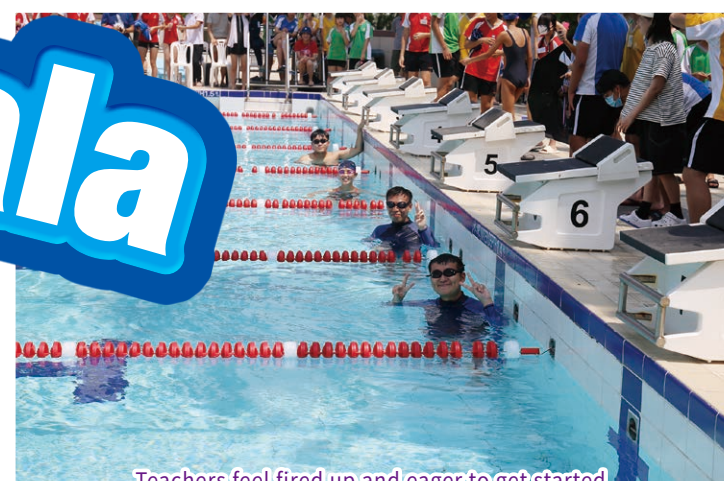
Teachers feel fired up and eager to get started.