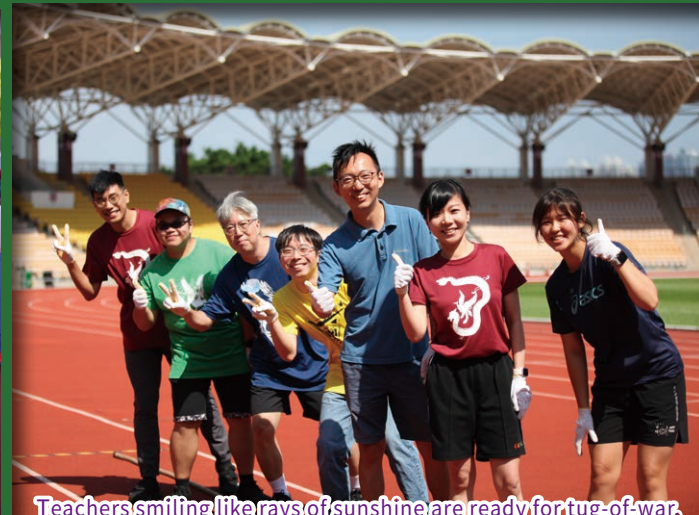
Teachers smiling like rays of sunshine are ready for tug-of-war.