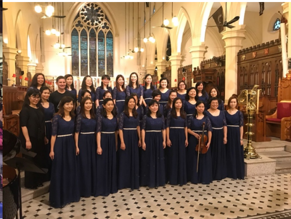
Choir Performance @St John's Cathedral