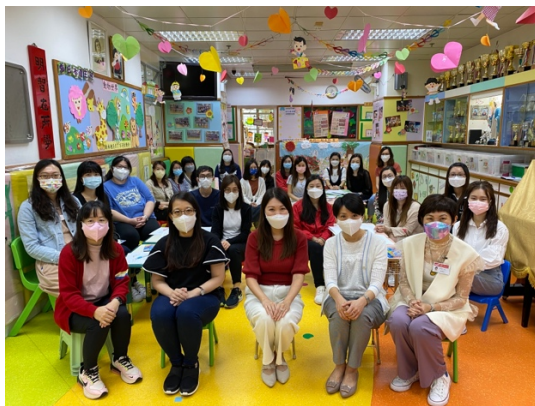
School training workshops