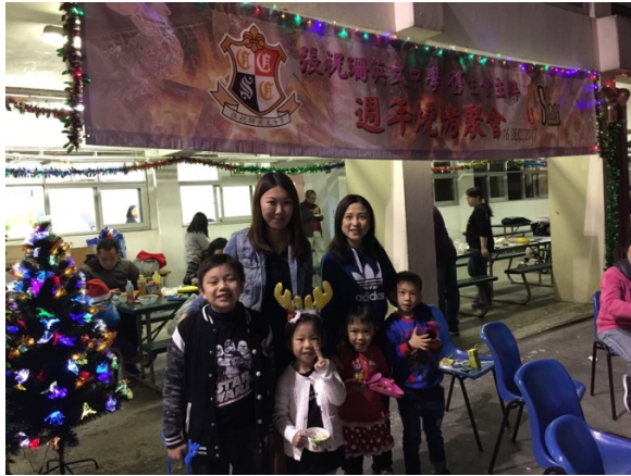
BBQ gathering 2017@CCSC